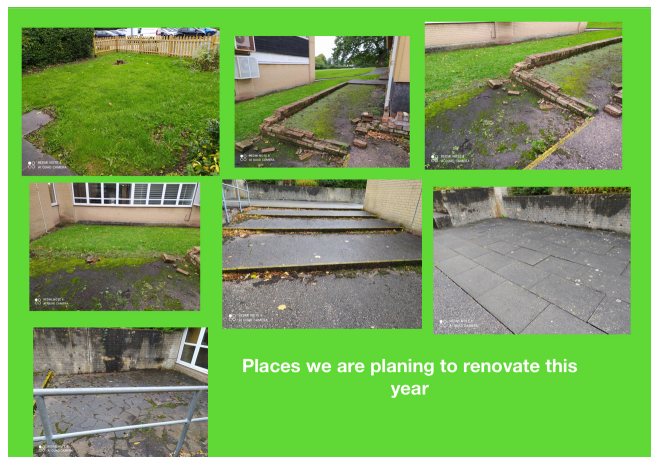
Places we are planning to renovate this year