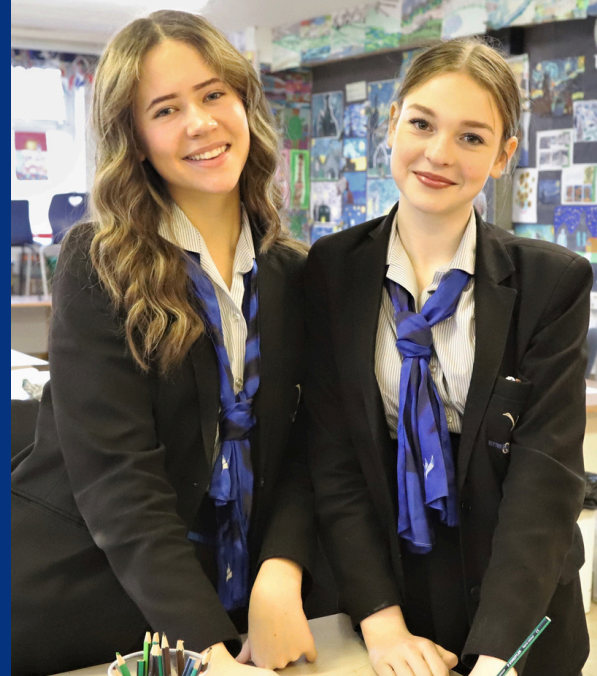
Photo of the week #weareblythe

Highlights of this week's news at school and forthcoming events