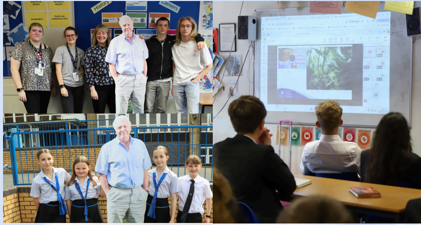
Photo of the week #weareblythe

Highlights of this week's news at school and forthcoming events