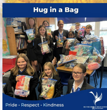
Hug in a Bag

A massive well done to Year 7, who made some delicious sausage rolls in food technology this week. Flaky pastry? Check! Working together to cook and clean? Double check! We're sure everyone at home will be happy to sample the sausage rolls - bon appétit!